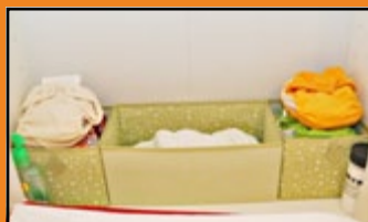
Organised and colour coded change table.