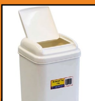
Suitable bin to dispose of non-reusable nappy liners or wipes*.