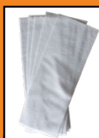
Support parents who bring reusable liners.