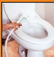
Accessibility to toilets to flush away solid waste.