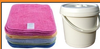
Move to using cloth bottom wipes and support this in your washing routine in care

* Do not flush non-reusable nappy liners, wipes etc down the toilet